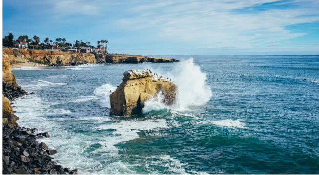
View of Sunset Cliffs San Diego, Ca.