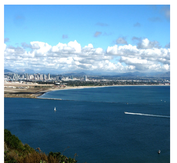
View of the San Diego Bay, Ca.

Presented by 'sdwatersheds.' A look at the SD Bay watershed! (4 minutes.)